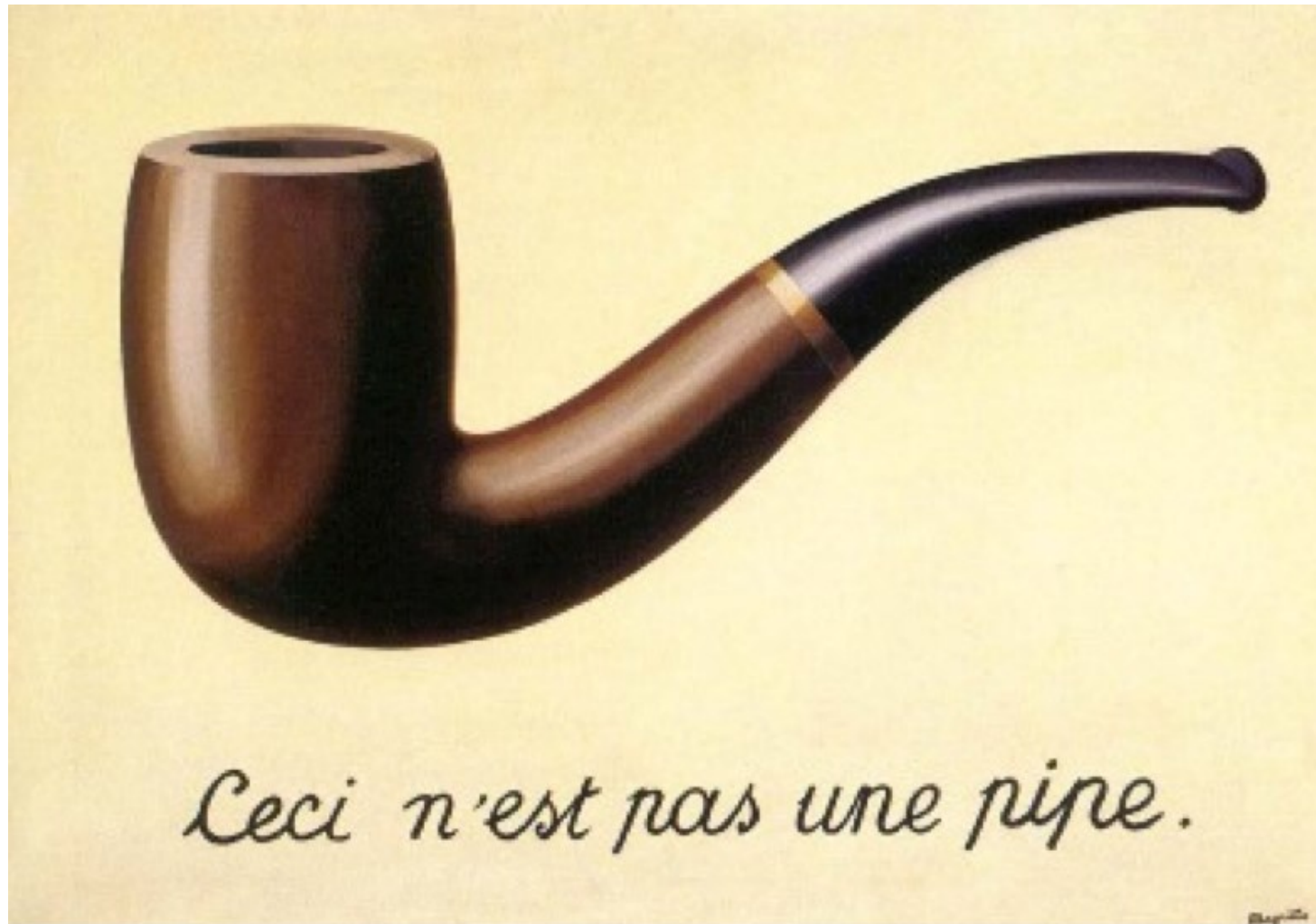
(The Treason of Images – René Magritte)